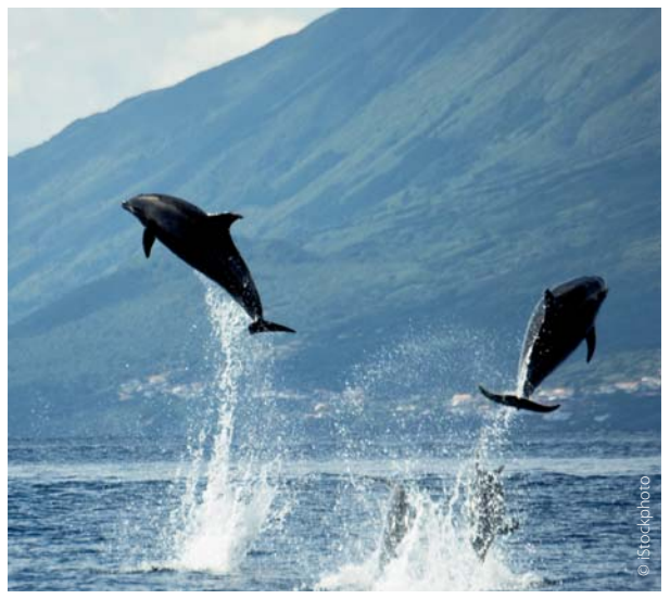
More data is needed on marine species

The process of producing these reports was difficult, but will become easier as monitoring systems become more developed. A review system is under way to develop better ways to compile and integrate data. The benchmark has been set, and will serve as the point of comparison when the reporting process is next repeated, in 2013.