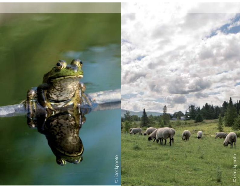
Amphibians are sensitive to climate change