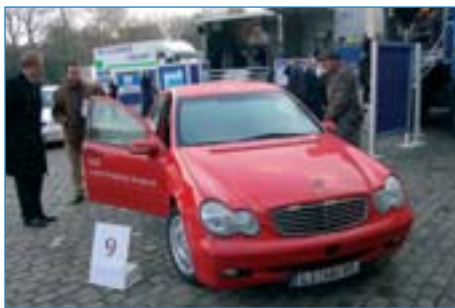
Demonstrators at the Intelligent Car Initiative launch in Brussels, February 2006

Consumer research shows that the low market uptake and penetration of eSafety technologies is partly due to the fact that consumers, drivers and policy-makers know too little about the benefits of these systems, and about the way they function. Active information dissemination to wide audiences is therefore the third field of activity of the Intelligent Car Initiative.