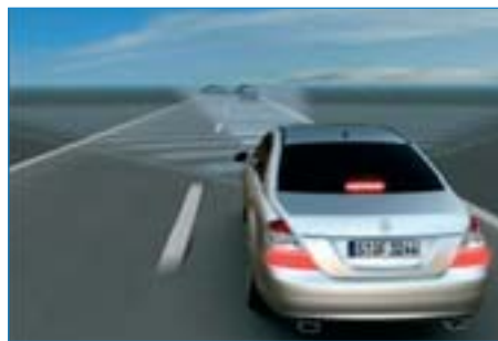
Radar detection can warn drivers of problems ahead

If widely deployed AWAKE is expected to significantly reduce traffic accidents caused by drowsy drivers. Three prototypes have been developed within the project, one for city-cars (Fiat Stilo), one for luxury-cars (Mercedes S-Class) and one for heavy vehicles (Mercedes Actros). These are currently being tested to assess the full impact of the system on driver behaviour.