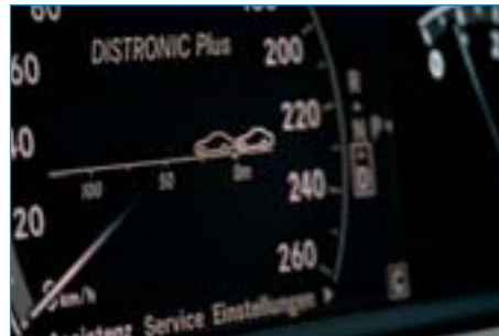
Advanced cruise control systems use radar to help drivers maintain a safe distance

Further action in research and development is also needed, to build upon the major investments in intelligent vehicle technologies made under previous European Research Programmes. It is also important to maintain European industry competitiveness towards Japan and the US where similar research programmes exist.