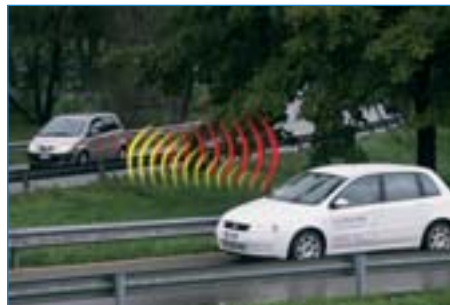
The CarTALK vehicle communication system

Developed under the CarTALK 2000 project, the idea is for information sensed from the vehicle's environment and information about manoeuvres to be transmitted from one car to other cars in the vicinity. This allows early reactions like braking if some vehicles in front have had to use emergency braking, and so helps prevent rear-end collisions.