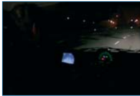
Night vision is one of many, new intelligent systems to support drivers

A recent survey by EuroTest, a European motorists' organisation, showed that only half the drivers surveyed were familiar with existing basic in-vehicle technologies providing active and passive safety. Only 50% of them, for example, knew the features of the anti-lock braking system that is now fitted in almost all new vehicles.