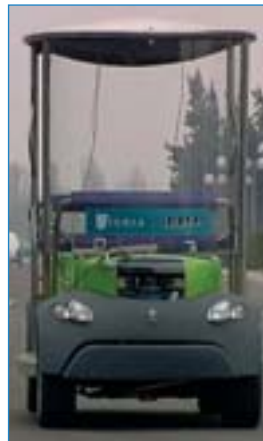
A CyberCars driverless vehicle

Project results of COMUNICAR are one of the main building blocks for AIDE , a current Integrated Project focusing on the design and development of an adaptive and integrated HMI.