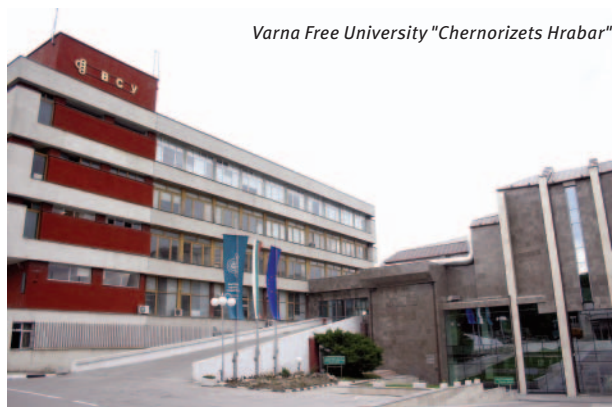
Varna Free University "Chernorizets Hrabar"

18 | Jean Monnet Chair of Political Science (since 2004) Varna Free University "Chernorizets Hrabar", Bulgaria