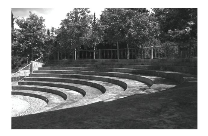
Figure 30: São José de Alcalar Village – Mexilhoeira Grande, Portimão Picture by António Pinto, architect (2011)

The São José de Alcalar village was designed by the architect Martin Garcias, who developed a composed structure of five cores that respond to the functions of housing, support services for the village, fellowship and support for visitors, arranged in a radial and concentric design.