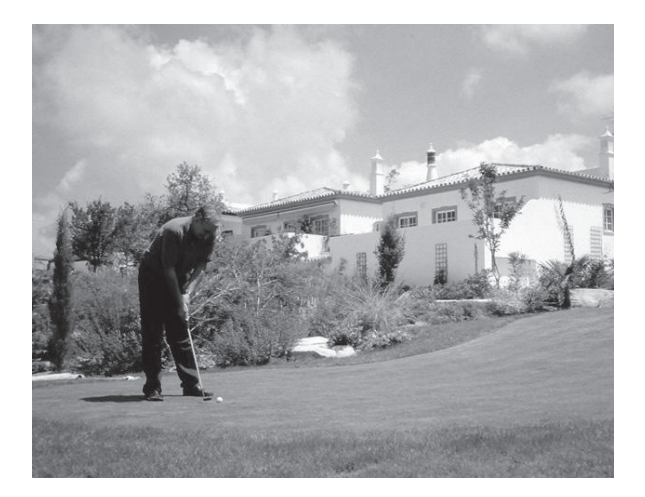
Figure 32: Monte da Palhagueira – Gorjões, Faro

The villages are characterized by their urban structure defined over time of their formation and maturation, with the shared of the experience local community and reconciled with the housing and specialized support services for the elderly population.