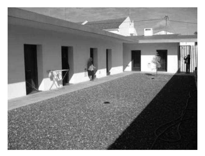
Figure 31: São Martinho das Amoreiras – Odemira, Beja

The concept of Home-Village includes structures designed and built for this purpose, where all services for its operation are provided, which may vary according to the specific needs of its population and the territory where it stands, as well as the use of towns and villages, in the interior of the country (Portugal), in the process of depopulation and desertification of the territory. These may be the preferred spaces for the installation of housing and support services for the aging population (local, national and foreign) in order to improve their quality of life and simultaneously encourage the setting of the population by creating specialized jobs in the area of geriatrics and long-term care, among others, promoting its intergenerational component.