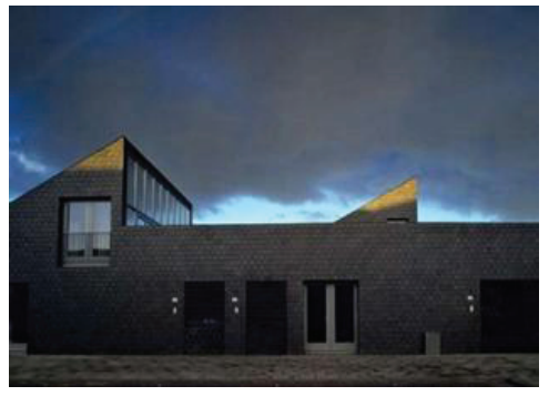
Figure 33: Ypenburg (Holland)<sup>41</sup>

In 2004 the Bauhaus Foundation began promoting a project, based on utopian and futuristic models, for medium-sized German cities, targeting the year 2030.