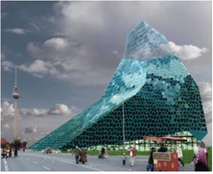
Figure 34: Geropólis conceptual project<sup>42</sup>