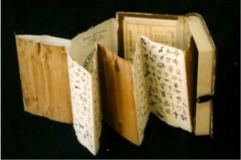
Figure 2. Arundel .

phonetic and logographic symbols (Robinson, 2013: 8). This is a characteristic of Oliveira's work: a recurrence of seemingly old languages and scripts which are graphic evocations of lost civilizations embodied in archaizing books.