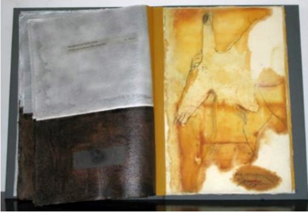
Figure 17. Leçons de Ténèbres: Ein Trauerspiel.