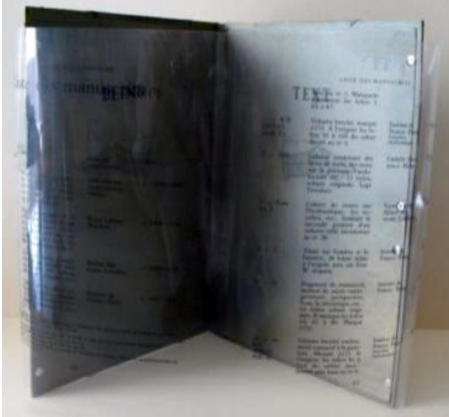
Figure 4. “No(w) title (blind book)”, 2008.

historically close to artist’s books: boxes with objects including sheets of paper with writing or drawings, sculptures using books as one or more of their parts, or books that cannot be opened.