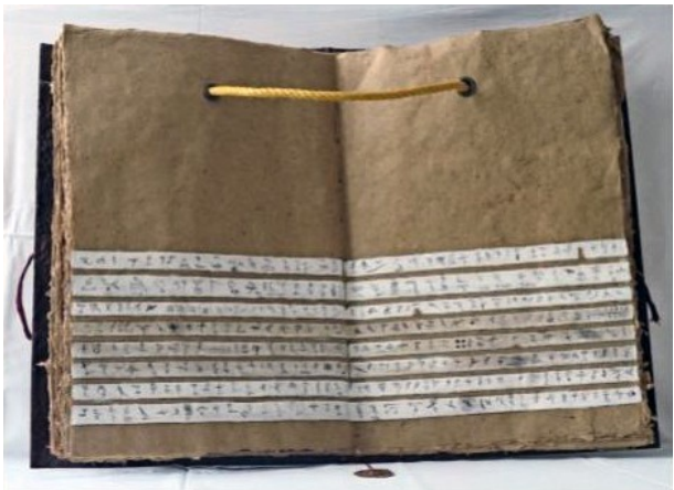
Figure 12. Codex Disio.