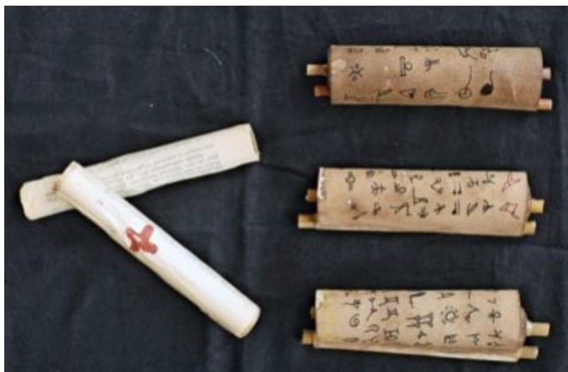
Figure 6. Ghazal .