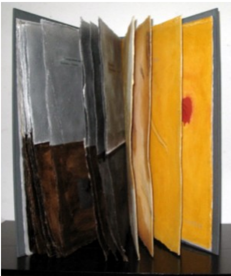
Figure 15. Leçons de Ténèbres: Ein Trauerspiel.