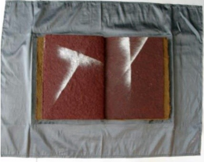
Figure 9. Códice Aléria 1463-1480 : the cover fully opened.

Codex Disio (2001) originates in the same kind of self-reflexivity. “Disio” or “Desio” means desire and nostalgia, and is a materialization of both states of mind. The book is heavy and big; it measures 68(w) x 87(h) cm. Holding and handling it is further complicated by a rope that cuts through the book from the first to the last page (Figure 10). It is a thick rope that runs in eyelets and is prevented from slipping with a big knot at each end. Eyelets hold the rope at the upper half of the pages. The bottom half of rectos contains the text. It is disposed in white and light yellow stripes that protrude from the light brown handmade paper. This text is not written in a known alphabet; it is again composed by small drawings halfway between hieroglyphs and runes. We can only guess at their meaning. The versos are painted in a dark red (Figure 11). In the central spread we see a text written in continuous rows (Figure 12). The only intelligible text is written in the seal that hangs from the gutter, “Vir mitis” (gentle or mature man). These words belong to a motet composed by Johannes Ciconia c. 1410 in honor of Cardinal Francesco Zabarella, “ Doctorum Principem/Melodia Suavissima/Vir Mitis ”.