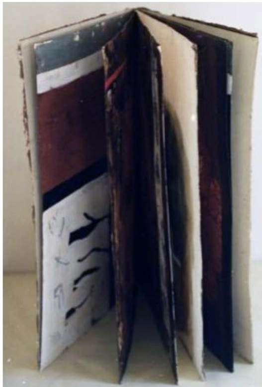
Figure 13. Mer-Mère 1933-1995 .