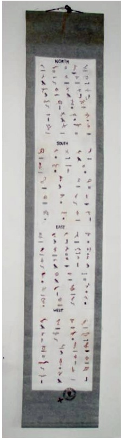
Figure 3. Aegyptian Piece n° 0.34.