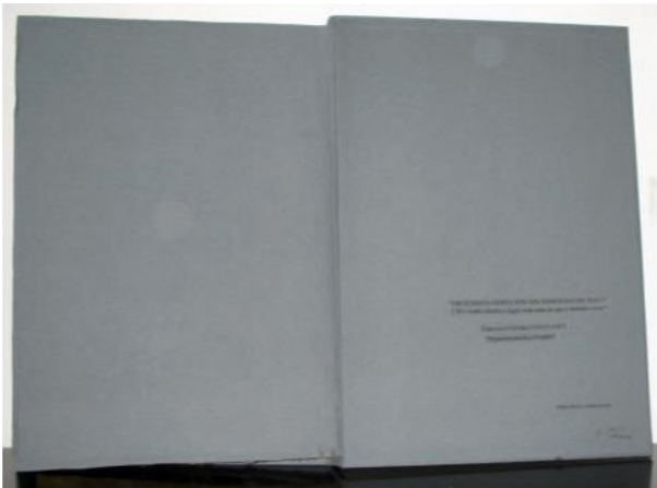
Figure 19. Leçons de Ténèbres: Ein Trauerspiel.