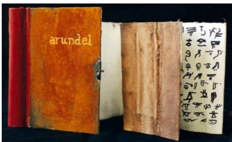
Figure 1. Arundel .

Book format is the cherished art form for José Oliveira expressing his art. His books are mainly codices, but he has also produced scrolls and leporellos. Oliveira uses each format with specific aims: to enhance the difficulty of reading, to puzzle the reader, to establish cultural connections. Oliveira uses the typographic and bibliographic conventions to disrupt reading as an active element in the emergence of perceived form. His books are artistic objects that combine self-reflection on their condition as books with self-reflection on their condition as artistic objects (Portela, 2013b: 96).