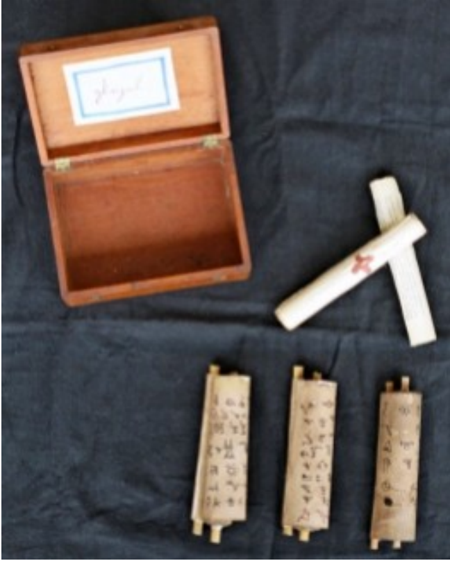
Figure 5. Ghazal .

Conversely, in the Ghazal box (2005) we find unreadable objects that are proper books and readable objects that are not books.