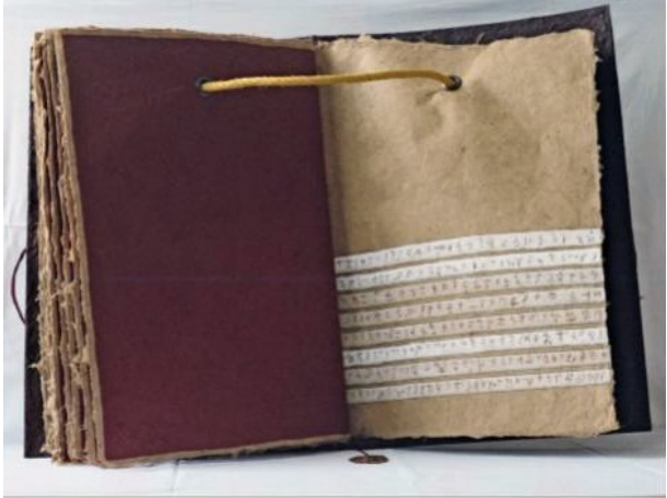
Figure 11. Codex Disio.