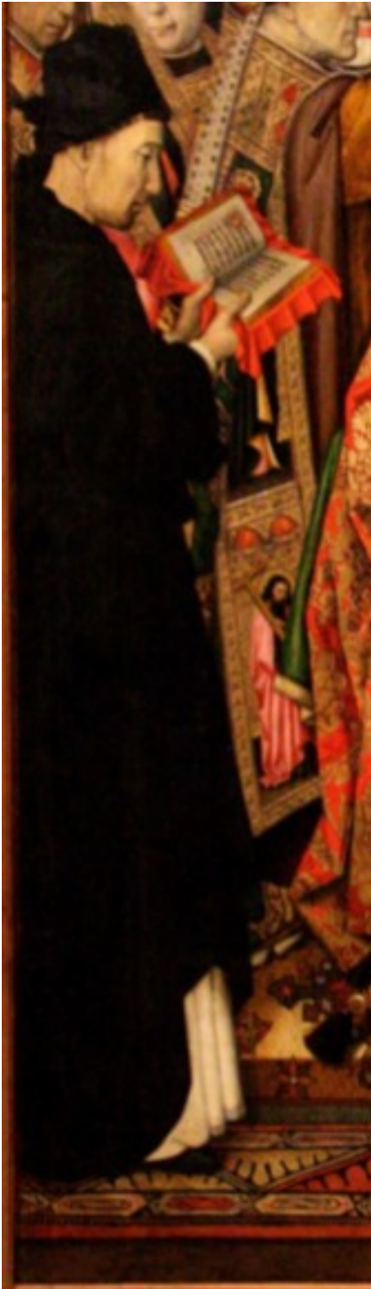
Figure 7. Jaume Huguet’s “The consecration of St Augustine”, detail.