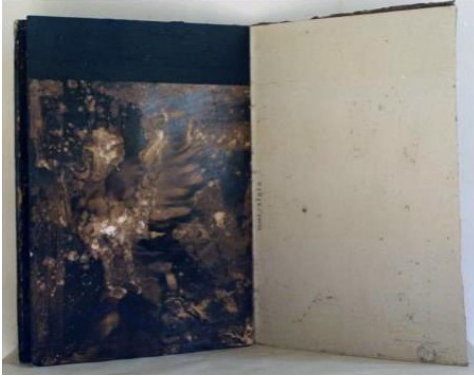
Figure 14. Mer-Mère 1933-1995.