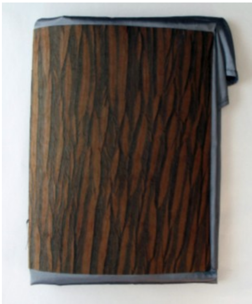
Figure 8. Códice Aléria 1463-1480.