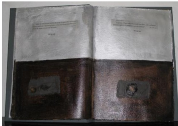
Figure 16. Leçons de Ténèbres: Ein Trauerspiel .