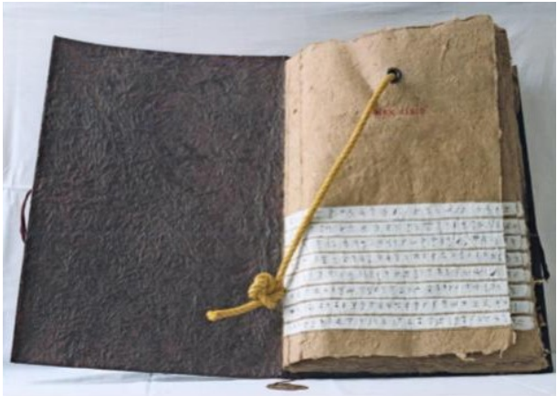
Figure 10. Codex Disio.