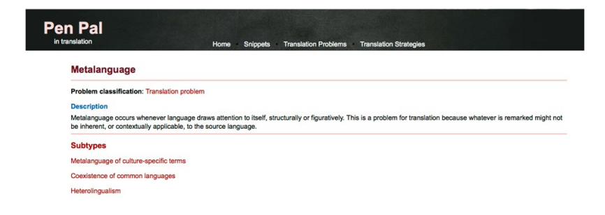
Figure 2. Representation of a translation problem type.

The problem in this example is twofold: on the one hand, there is a "cultural lexical gap" (Janssen, 2012) as the reality named by "decorations" was still not captured by the Portuguese lexical equivalent, "enfeites", at the time of writing. On the other hand, in this literary excerpt, language is calling attention to itself, and in particular to how it fictionalizes the speech of a foreign tongue (the "they" referred to are American English speakers; the speech enunciator in the example is probably speaking Portuguese). The indication of type(s) of problems can represent both different types of problems at stake and near-synonymous terms for the same problem.