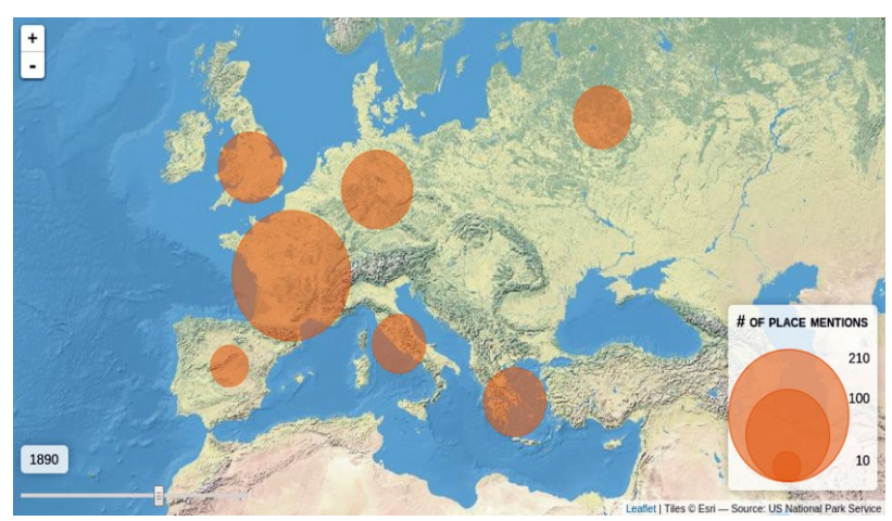
Figure 3. Mentions per nation in the Corpus Critique in 1890 (France: 207; Italy: 42; England: 61; Spain: 21; Russia: 48; Germany: 75; Greece: 58).