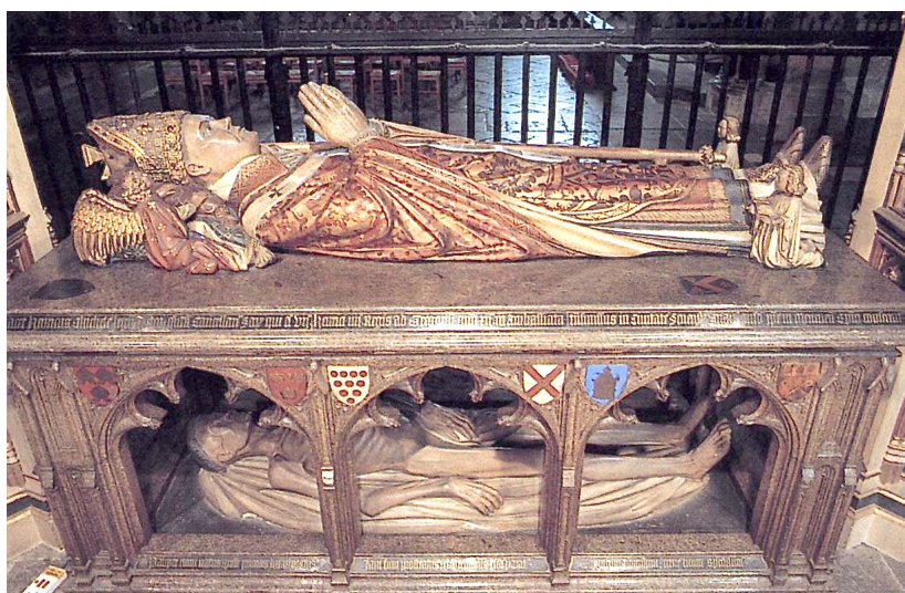
Fig.1 - Tomb of Archbishop Henry Chichele. Canterbury Cathedral