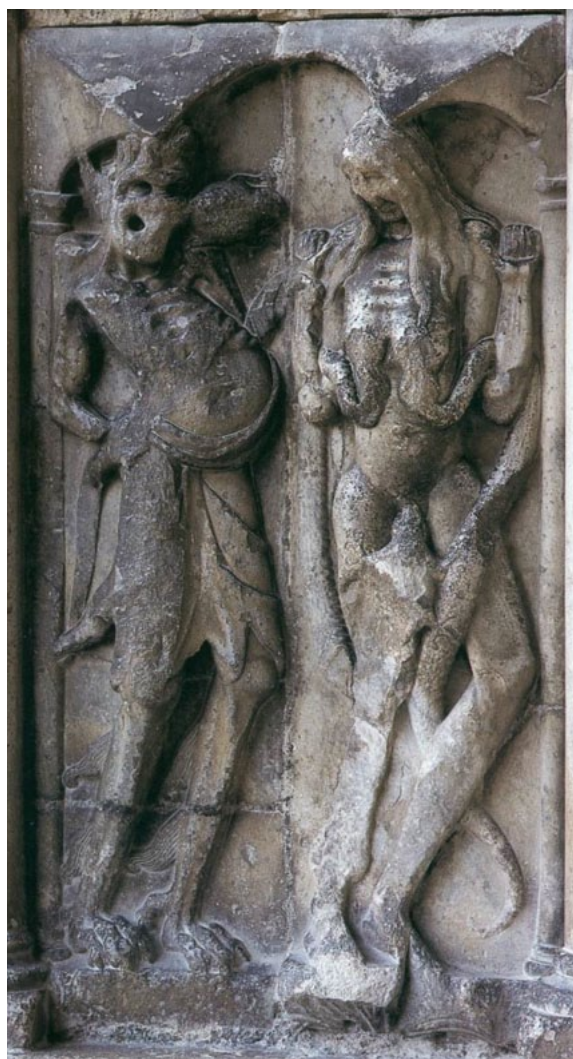
Fig.2 - Femme aux Serpents . Church of the Abbey of St. Pierre in Moissac. South Portal

Furthermore, medieval imagery did not dodge either the blunt and realistic representation of the sick, marginalised or punished body. In relation with this, for example, it can even be remarked that both the chastising and punishing practices which were carried out in real life and those described in the Holy Writ were utterly surpassed. As J. Baschet (1993) points out,