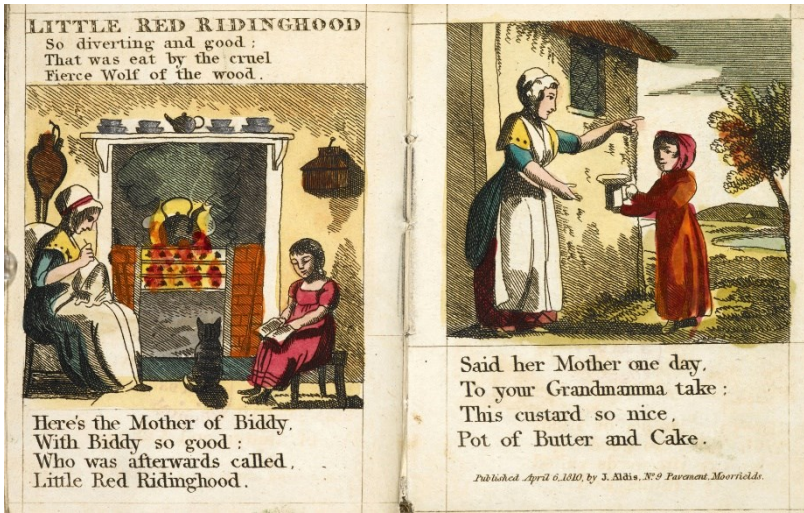
Figure 2. Little Red Riding Hood published London 1810 hand coloured chapbook, British Library. Predates the Grimm Brothers by two years.