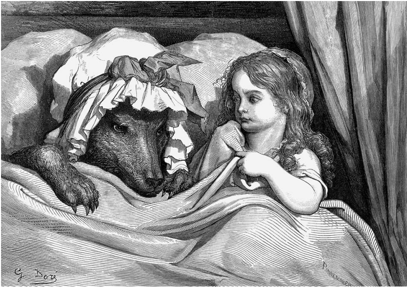
Figure 6. Gustave Doré's Romantic style illustrations appear in an 1867 edition entitled Les Contes de Perrault .

Crane's image did more for my narrative imagination than Charles Perrault's (1697) moralising endnote: