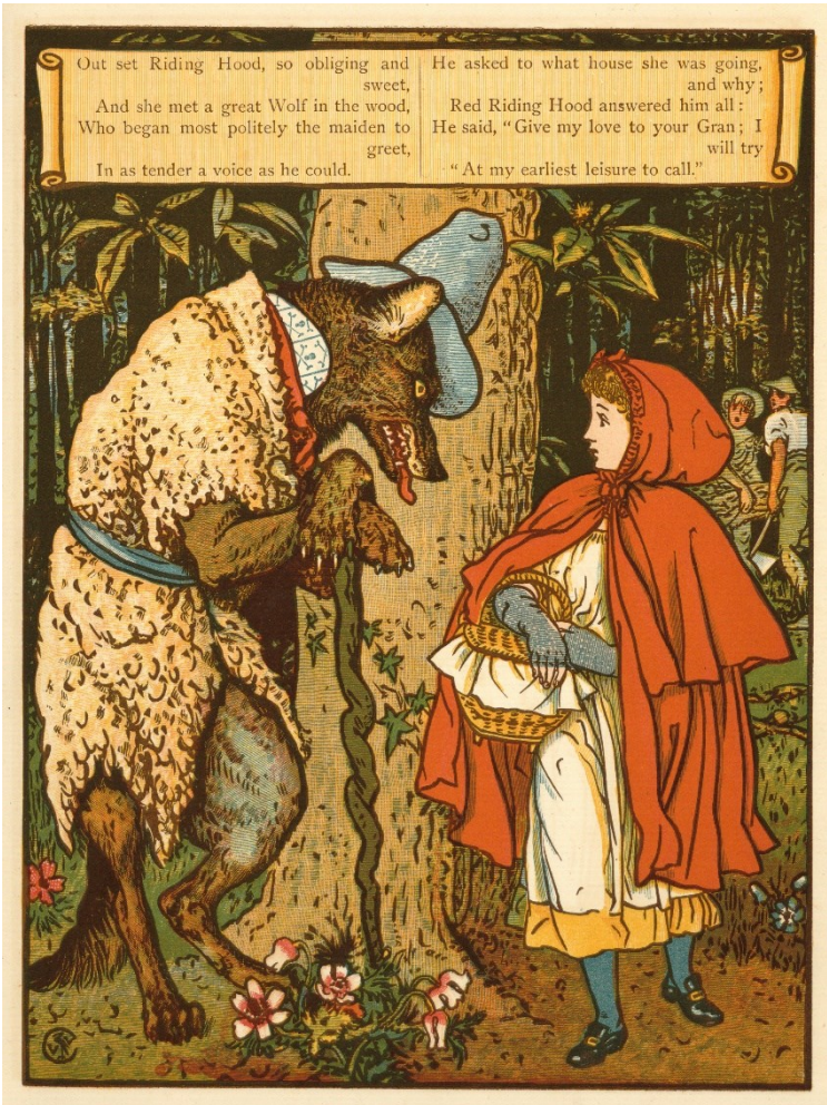
Figure 4. Walter Crane's 1875 Illustration (p5) offering intertextual interpretation.

Bruno Bettelheim (1975), when considering the meaning of folk/fairy tales, posited that they “carry important messages to the conscious, the preconscious, and the unconscious mind, on whatever level each is functioning at the time.” Pre Internet most audiences would have received (and decoded) their folk stories within culturally defined and possibly even learning context.