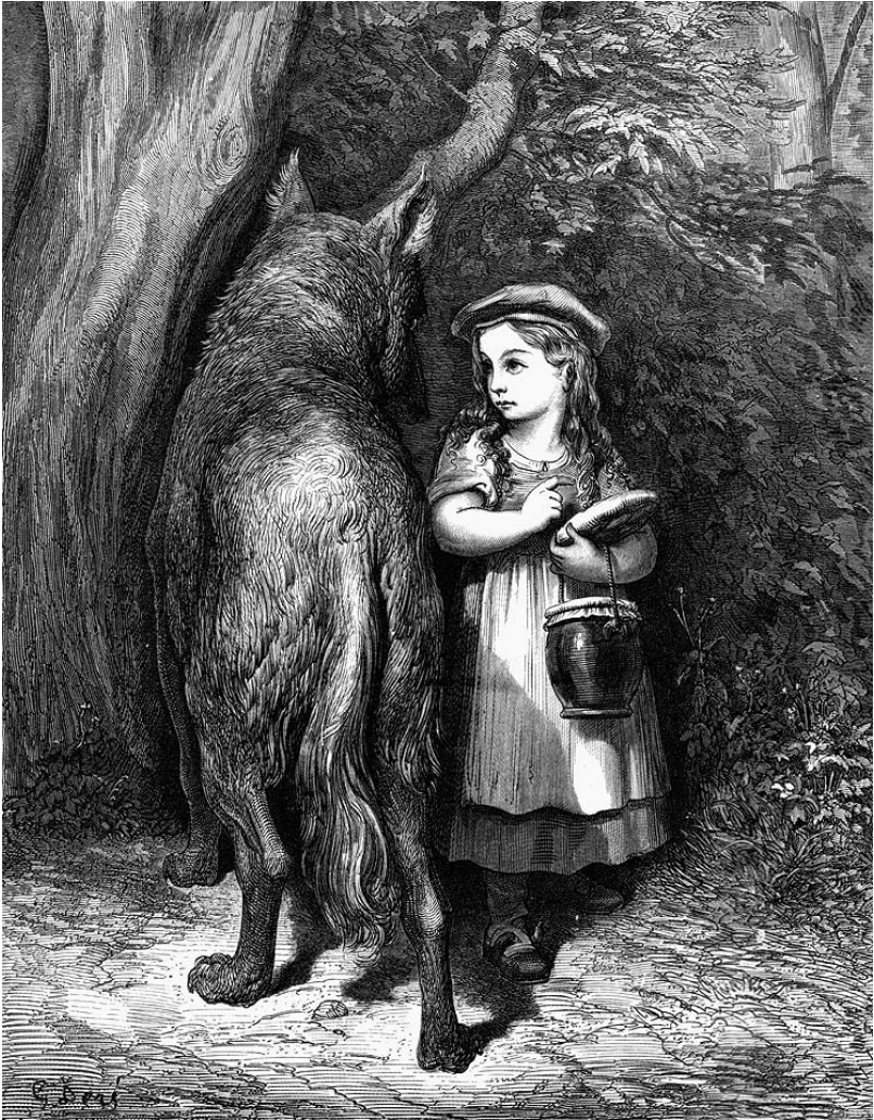
Figure 5. Gustave Doré's Romantic style illustrations appear in an 1867 edition entitled Les Contes de Perrault .

Very much in keeping with Bettelheim's notion I discovered — at some formative stage of my creative consciousness — Walter Crane's six penny book published by George Routledge & Sons in 1875. This version of Little Red Riding Hood was dominated by Crane's Art Nouveau illustrations, and page 5 in particular shocked me as it depicted a slaving anthropomorphic Wolf. His visualization of the Wolf was a significant interjection deviating from the chapbooks of the era as well as the likes of his contemporary Gustave Doré, 7 all of whom typically portrayed the wolf very much as a naturalistic creature.