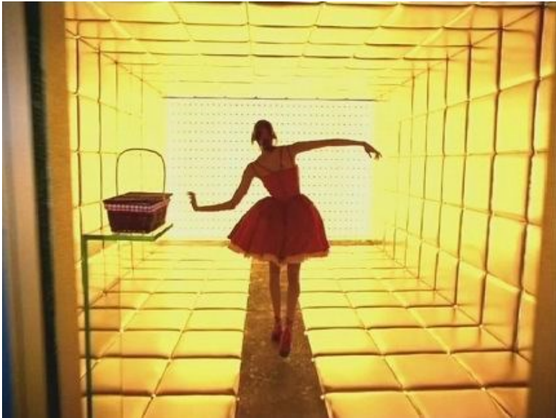
Figure 3. Still from 'Rue Faubourg Chanel N°5' Commercial, casting the model Estella Warren as Little Red Riding Hood (2002), director Luc Besson.

The mutability of folk stories through significant cultural and media epochs, such as Orality / Print / Film / Gaming / Internet / Mobile Technologies, is impressively resilient. Like a biological species they descend and modify