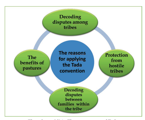
The scheme No 1. The reasons put of Tada

At the level of Ait Atta tribe: the purpose of the contracted alliance between the tribal sub-groups composed of the Ait Atta Federation is to manage the affairs of the tribe and the distribution of economic resources such as grazing areas, especially water, which is known as a kind of scarcity in these areas. These can lead to many conflicts around them. In that case, the contracted alliance through the Tada is considered as a peace for these tribes. But, the other reason is political rather than economic. The Al-attawiya tribes did not sweep the south-east by relying on military action and the use of force, but they also created a socio-political space for them. They developed a range of tools and methods that enabled them to reach a number of regions<sup>6</sup>; this is through the alliances which contracted it with other tribes and this strengthened its influence from Daraa to Twat and within its expansion without resorting to conflicts and wars.