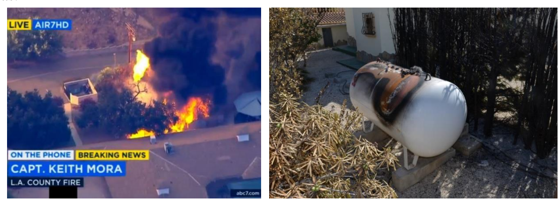
Figure 2 - Left: Calabassas fire (California, 2016). A propane jet fire can be observed at the centre of the image. Flames from ornamental fuels are close to the tank. LPG infrastructure was inside a kindergarten facility. Right: Domestic LPG tank in Benitatxell (Spain, 2016) damaged by the jet fire. The tank was surrounded by an ornamental hedgerow that ignited by spotting.

In recent WUI fire events (e.g. Benitatxell, Spain, 2016; Madeira, Portugal, 2016; Calabassas, California, 2016) these type of infrastructures were dangerously involved in the emergency (figure 2). The lack of an effective safety distance between the LPG tank and the surrounding fuels, provoked undesired overpressure inside the tanks leading to the opening of the safety relief valves. Released gas immediately ignited giving rise to intense jet fires. Although explosions did not occur, the magnitude of the consequences in case of a BLEVE (Boling Liquid Expanding Vapour Explosion)-Fireball event could have been devastating, given the high population and assets density that usually characterize WUI areas.