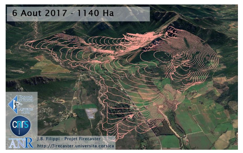
Figure 3 - Rapid-Response simulation, without firefighting actions. Fire as pink 20 minutes isolines, 7 hours total duration.

Rapid response web simulation of the fire (available in less than 2 minutes) also allowed to guess the possible extent of the fire (figure 3), and evolution. Fortunately this fire was very quickly handled by firefighters and almost stopped in less than 2 hours.