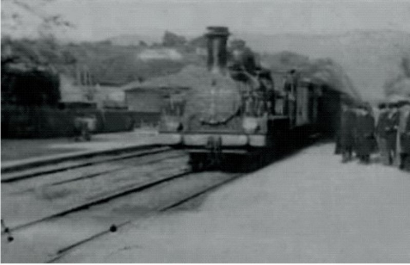
Figure 2. Arrival of a Train at La Ciotat , 1895, by The Lumière Brothers.