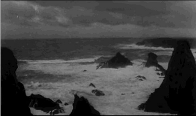
Figure 1. Le Tempestaire , 1947, by Jean Epstein.

construction of projective, imaginary and narrative space ; 2) the design and manipulation of information space ; and 3) the digital flaneur's exploration of embodied space . I consider these distinct yet interrelated spaces as zones where digital cinema-writing happens.