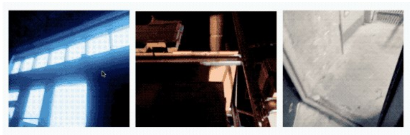
Figure 10. Voodle , 2017, by Sam Renseiw.

Amerika's feature film, Immobilité , made with a low-resolution mobile phone, is an improvisational fiction with two performers. Rather than strive to create an immersive narrative world, the work is a dérive in and out of an imagined foreign film, in which images and moving camera effects are unmoored from the subtitles and narrator's attempt to bring order. Amerika's palm-held camera work is erratic, intentionally amateurish and painterly. The camera's pixel grid has to catch up with the body's fluid gestures in its spontaneous encounters with the performers and the landscape, resulting in unexpected blurs and trails of color. Amerika equates this form of aimless cinematography with choreography and Gregory Ulmer's term choragraphy , which he (Amerika) defines as "the writing of intuition while inventing" (Amerika, 2009). In the Director's Notebook accompanying the film, Amerika cites Brian Massumi's description of this movement-vision as an "opening onto a space of transformation in which a de-objectified movement fuses with a de-subjectified observer. This larger processuality, this real movement, includes the perspective from which it is seen."