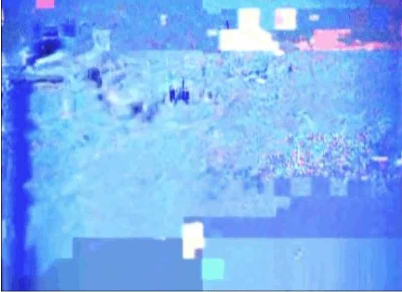
Figure 7. The Ceibas Cycle , 2007, by Evan Meaney.

single protagonist's mind. However, what is depicted is the sprawling space of consciousness itself—a network of text/image associations, evasions, recursions, worlds within worlds—and can be experienced as affective cinema without necessarily solving the narrative puzzle.