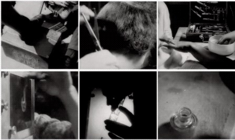
Figure 4. Man with a Movie Camera , 1929, by Dziga Vertov.

German Duarte, in his book Fractal Narrative , explores the evolution of cinema art as an increasingly complex geometry that, like the spatialization of hypertext and hypermedia, challenges classical narrative forms. For his theory of a fractal cinema space, Duarte draws on Deleuze’s study of the geometrical rather than linguistic rules that govern narrative cinema. Deleuze looks to cinema as a tool to liberate human thought from hierarchical models and linguistic metaphors. For Deleuze, the essence of montage is “the act of putting the cinematographic image in relation with the Whole, that is, to link a single object with universal time” (qtd. in Duarte, 2014: 271).