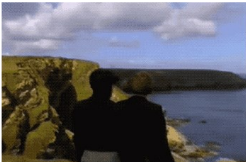
Figure 9. Immobilité , 2008, by Mark Amerika.

Amerika's feature film, Immobilité , made with a low-resolution mobile phone, is an improvisational fiction with two performers. Rather than strive to create an immersive narrative world, the work is a dérive in and out of an imagined foreign film, in which images and moving camera effects are unmoored from the subtitles and narrator's attempt to bring order. Amerika's palm-held camera work is erratic, intentionally amateurish and painterly. The camera's pixel grid has to catch up with the body's fluid gestures in its spontaneous encounters with the performers and the landscape, resulting in unexpected blurs and trails of color. Amerika equates this form of aimless cinematography with choreography and Gregory Ulmer's term choragraphy , which he (Amerika) defines as "the writing of intuition while inventing" (Amerika, 2009). In the Director's Notebook accompanying the film, Amerika cites Brian Massumi's description of this movement-vision as an "opening onto a space of transformation in which a de-objectified movement fuses with a de-subjectified observer. This larger processuality, this real movement, includes the perspective from which it is seen."