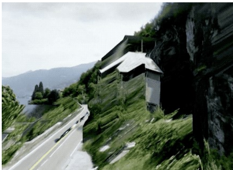
Figure 8. Lake Cuomo Remix , 2012, by Mark Amerika.