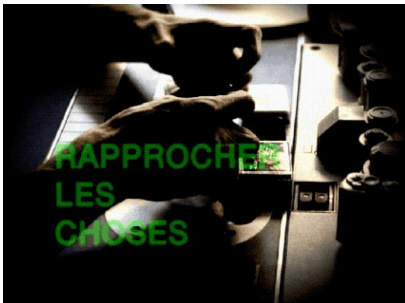
Figure 11. Histoires du Cinéma , 2011, by Jean-Luc Godard.

Of the remaining idiosyncratic cinema-writers of 20th century, Jean-Luc Godard points to the end of one era and the beginning of another. His Histoire(s) du