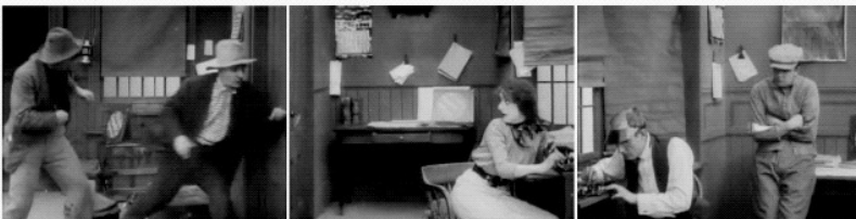
Figure 3. A Girl and Her Trust , 1912, by D.W. Griffith.

Cinema, like much of digital writing, is a spatial practice. According to Jay Bolter, all writing is spatial and different writing technologies present different kinds of spaces to exploit (Bolter, 1991: 105). The earliest films played with projective and imaginary space. A train arrives at the station and the audience in the theater ducks, as the legend goes. The projective screen space—the tracks receding into the distance, the train getting bigger as it approaches—creates the illusion of a world in three dimensions. When the train leaves the frame, the audience engages in an imaginary space, the three dimensions beyond the screen. It is this fragmentary nature of the cinema image that gives us an imaginary world, a whole.