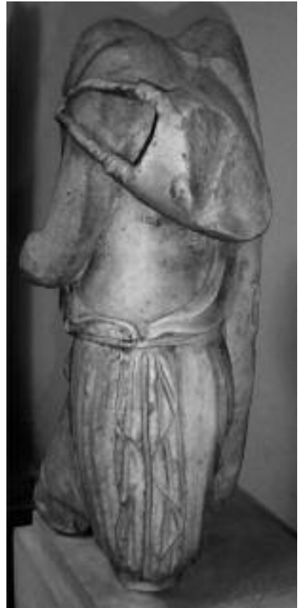
Fig. 5b: Left back side of Fig. 5a.

back (Fig. 4b) seems to have been a pad for a heavy load that the man was carrying. Of the same type of walking farmers usually carrying a load on their backs there is another example (Figs. 5a) 46 ; the statue wears the same exomis and carries a basket which is suspended with a thick rope across the chest (Fig. 5b). The movement is accentuated by the leaning of the body to the right, the open legs, and the rigid right knee. The muscled chest with protruding breasts is the same as Fig. 4 and is a naturalistic expression of hard labour. The publisher dates both statues, according to the style of drapery, to the late Hellenistic Period. In the absence of parallels, these two statues were compared to some similar representations in a statue of Odysseus from the Antikythera shipwreck 47 and the most interesting Triptole-