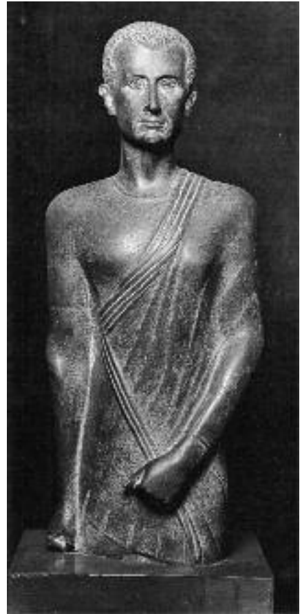
Fig. 3: Statue of Hor son of Hor, Cairo Egyptian Museum.

Recent excavations at the area proved that part of it was occupied by the Boubasteion 30 which was an early Ptolemaic religious centre. Excavations of the Polish expedition in the vicinity of the Boubasteion indicate that during the Ptolemaic Period the area was a Greek residential district 31 . The importance of this area was gradually increasing to the extent that in late Roman times it became part of the city's centre 32 .