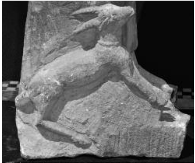
Fig. 6c: Goat at the right side of Fig. 6a.

us with the Egyptian striding figures of dynastic times. This Egyptianizing attire is emphasized by the high protruding ears, the plain linear eyebrows, almond eyes and the obscure facial features without any definite expression. Another unique feature is the presence of a short support at the back of the head (Fig. 6b) which seems to be a reminiscent of the Egyptian conventional back-pillar. However, Egyptian features are mingled with Greek ones; the man wears, not the exomis , but a long sleeved tunic and short necked boots. He carries in his left hand