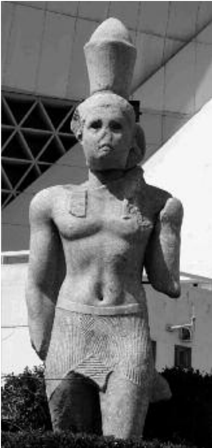
Fig. 2: Statue of Ptolemy II? , Alexandria.

resents a frontally standing Ptolemy with the left leg advanced in the conventional Egyptian style. He wears a ribbed nemes -headdress with the double crown and the shendyt . A mixture of Greek elements is clearly visible such as the royal diadem and the inlaid eyes (now missing) and a row of locks of hair which appear under the nemes . According to stylistic criteria, Empereur, the discoverer 22 , Grimal, Cortigiani, Yoyotte and Kiss dated the statue back to the first half of the 3rd century 23 . Others dated it to the mid-2nd century 24 . Guimier-Sorbets emphasizes the earlier date for the statue according to her study of the base and its ornaments, she interprets it as a posthumous figure of Ptolemy I executed during the reign of Ptolemy II and erected there on the occasion of the deification of Soter and his queen Berenice as Theoi Soteroi 25 .