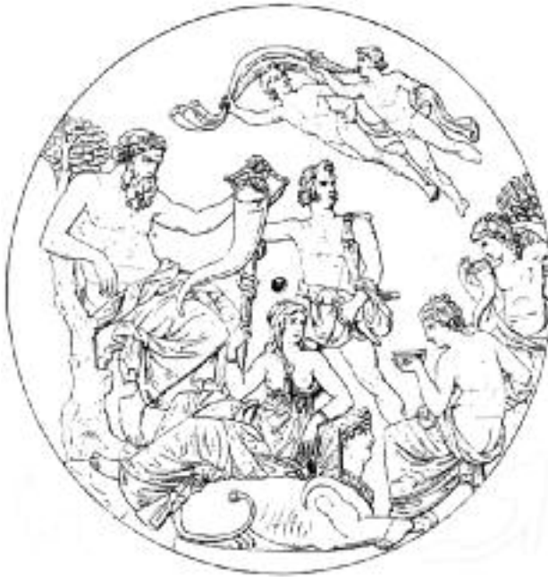
Fig. 7: Drawing of the interior scene of the Tazza Farnese, after Fürtwängler 1900: II, 256.

One last masterpiece which sheds light on other universal horizons of Alexandrian art is to be discussed here, the Tazza Farnese (Fig. 7) 54 . It is a Sardonyx cameo carved on its exterior with an aegis decorated with the head of the Gorgon Medusa, a familiar decorative figure which appears very frequently on Greco-Roman utensils and works of art. The scene on the inside of the bowl depicts a bearded god sitting on a tree trunk holding a cornucopia in his left hand. At the lower centre, a female figure reclines on a sphinx wearing a dress characterized by the Isis knot between the breasts. In her upraised right hand she holds what seem to be sheaves of grain. In the centre of the scene, strides a beardless male figure with a seed bag hanged to his left wrist, and holds in his left hand an object which is interpreted as a plow. On the right side of the scene recline two female figures, the lower one holds a phiale in her left hand and the upper one rests her right hand on a cornucopia while