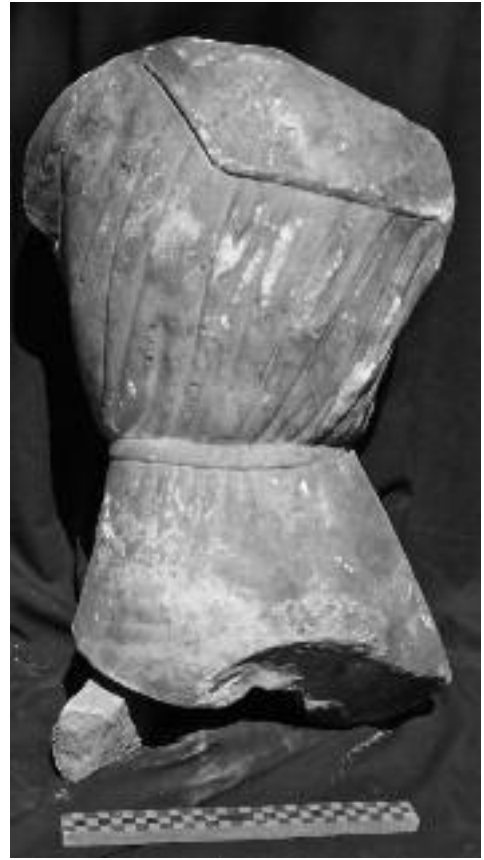
Fig. 4b: Back side of Fig. 4a.

ynoi and drink and eat as much as they can 43 . In the light of the previously mentioned literary texts, the Alexandrian origin of such a statue becomes unquestionable.