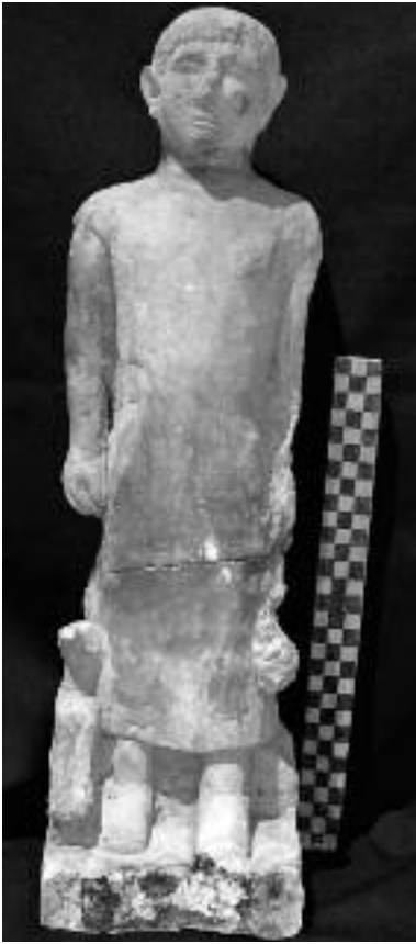
Fig. 6a: Statue of a shepherd , Port Saïd Museum.