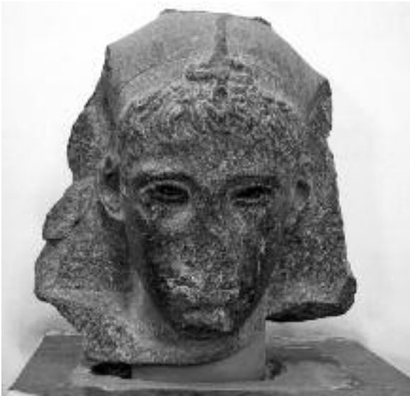
Fig. 1: Head of Ptolemy VI, Greco-Roman Museum of Alexandria (photo by the author).

Examples of this mixed style portraits are very numerous and are dated from the reign of Ptolemy IV to the end of the Ptolemaic rule. Their geographical distribution is so wide that they cover the entire country including Alexandria. The collection of the