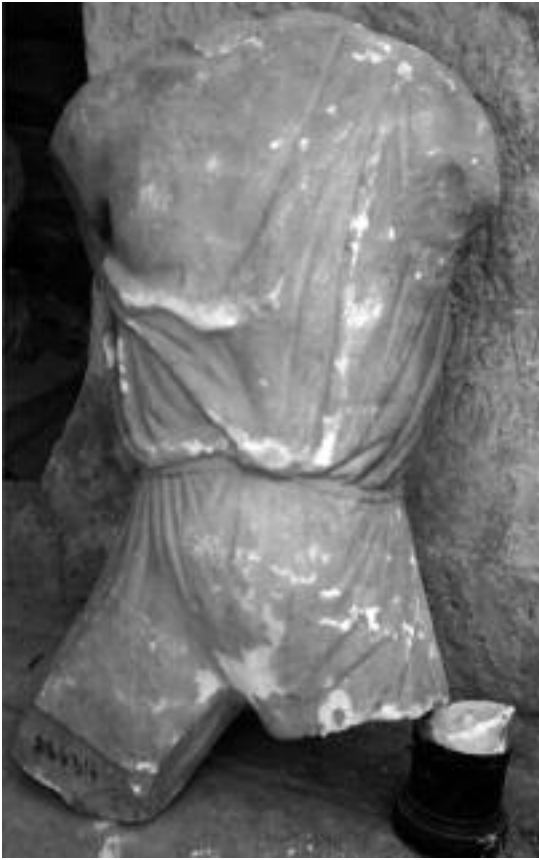
Fig. 4a: Statue of a farmer , Greco-Roman Museum of Alexandria.