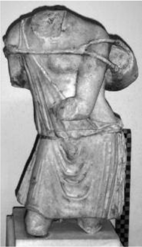
Fig. 5a: Statue of a farmer , Greco-Roman Museum of Alexandria.