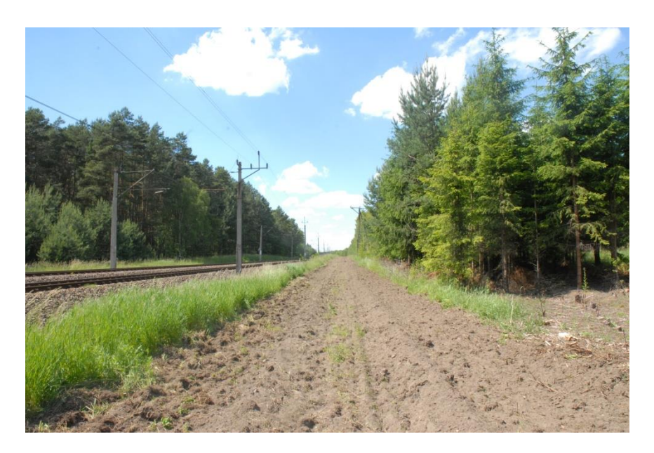
Figure 2. Modified firebreak beside the railway

In the case of modernisation of existing firebreaks it is recommended to use the existing first furrow, executing widening of this furrow to the required width from the side of the tracks, as the ground conditions permit. In connection with the above it has become essential to change the regulations currently in force through agreement of the ministers responsible for supervision of rail traffic, forests and fire prevention protection.